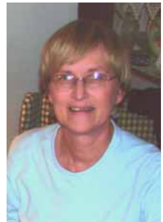
Program: Oct. 3-5