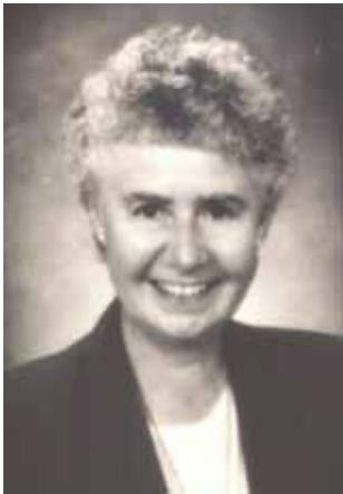
Program: Sept. 6-12