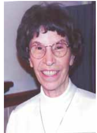
Program: Sept. 19-21